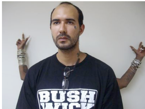
Illuminating Myself