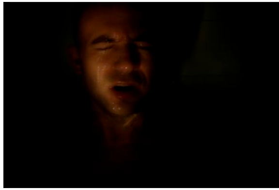
Waiting