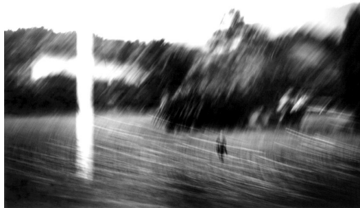
Marginal Movements