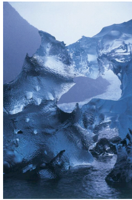
Threading the Needle

Also in November: four members of Soho Photo Gallery will be having solo shows.