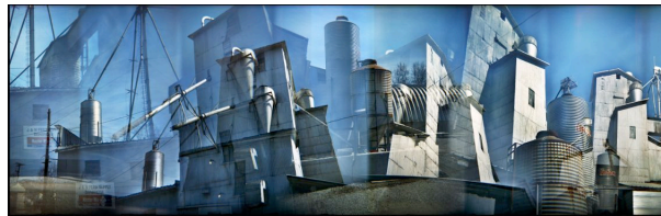
J&N Feed Supply

Joan Lebold Cohen's latest show at Soho Photo is entitled Absolute Blue , which includes ten views of the glacial ice from the San Raphael Glacier in Patagonia, Chile. Cohen says, "I had never seen a glacier from the water before, but I knew what I saw was the tip of the iceberg. There was the exquisite spectacle of the floe itself and then the individual pieces whimsically shaped like a lion, tortoise and flame. The sky was overcast with dark clouds and the glacial ice was a deep blue since as light strikes the ice crystals, all colors are absorbed except blue, which is reflected." The digital prints in Cohen's show, which record the extraordinary deep blue coloration, range from 11" x 14" to 20" x 24".