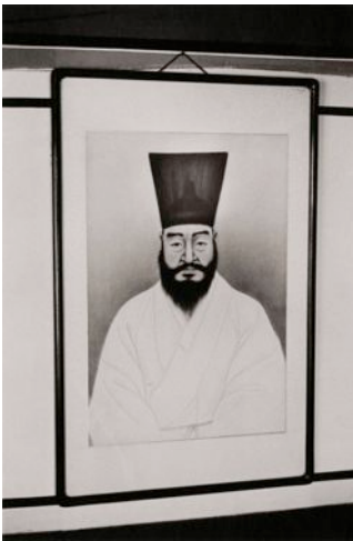
Susimdae_Plate_4_#5