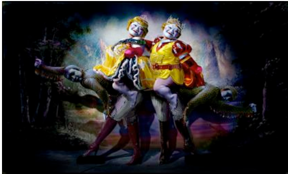
Dream of Impermanence