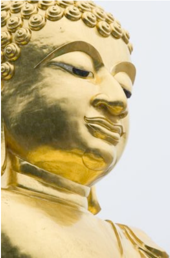
Gold Buddha